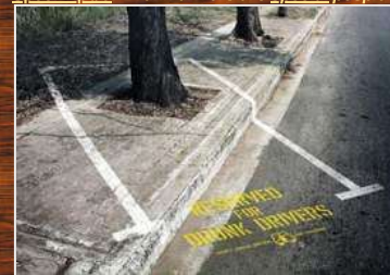
Spooftip #5: Drunk drivers are special people...