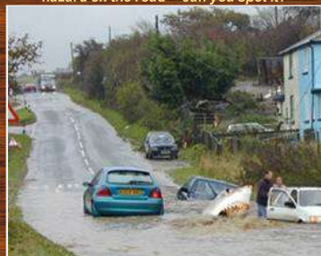
Spooftip #6: There's a new traffic hazard on the road -- can you spot it?