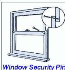
Window Security Pin